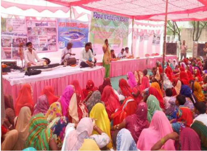
Celebration of world environment day