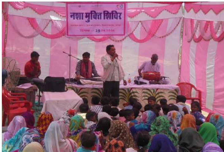
Organized drug-de addition awareness camp